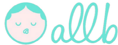
Type A Horizontal Options